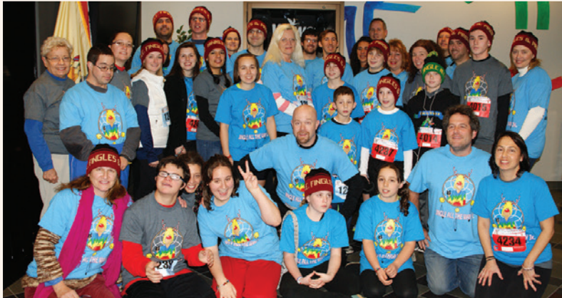
Special Olympics New Jersey 2014 Jingle Run

Team HF&P (above) was out in force with the largest team at the event with 76 people and raised over $9,300 for SONJ!